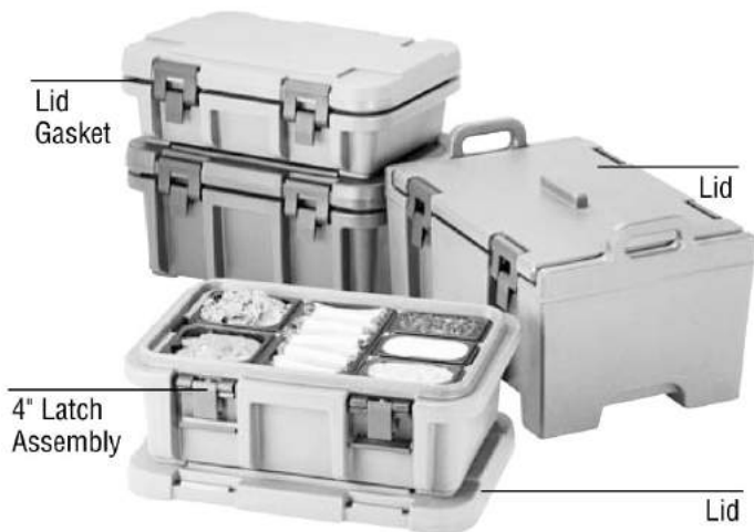
Ultra Pan Carriers UPC100, 140, 160, 180